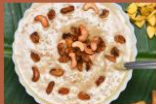
5. Pael Payasam