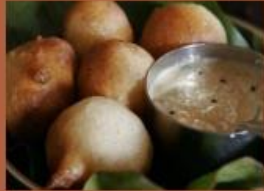
2. Goli Baje

Mangalore buns are sweet fried bread made with mashed bananas, flour, sugar and spiced with a touch of ground cumin. These sweet banana buns or poori as they are known is a speciality dish from the Mangalore region.