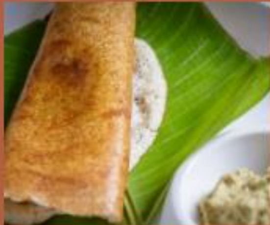
3. Masala Dosa

Mitra Samaj located next to Udupi's iconic Shri Krishna temple is one of the town's best-known food institutions. This modest eatery serves a variety of Udupi snacks but it's their Goli Baje the signature dish and usually available around 4 pm.