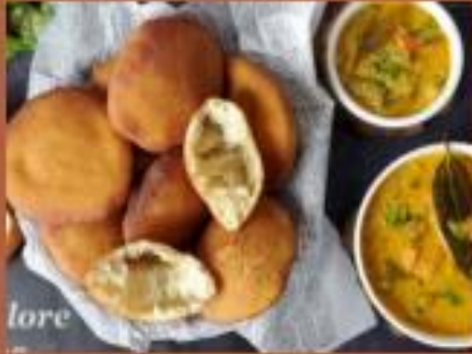
1. Mangalore Buns

Mangalore buns are sweet fried bread made with mashed bananas, flour, sugar and spiced with a touch of ground cumin. These sweet banana buns or poori as they are known is a speciality dish from the Mangalore region.